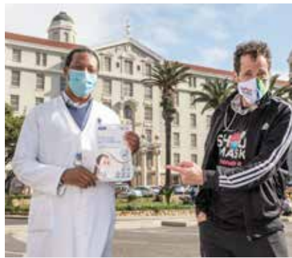
SHOUT SA DONATES MASKS METRO 5