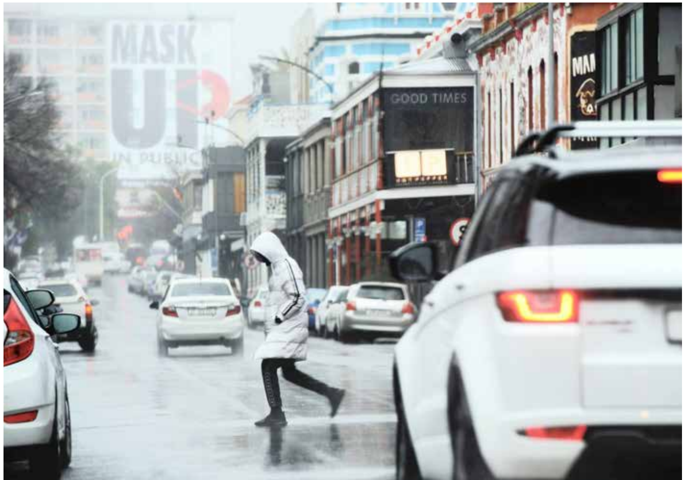
A MAJOR cold front has made landfall in the Western Cape.